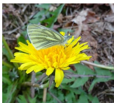
Green Veined White