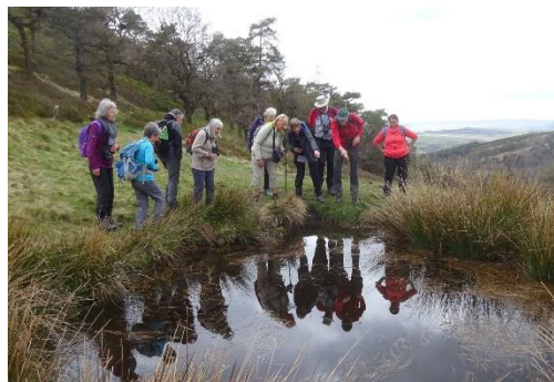
Are there tadpoles . . . ?