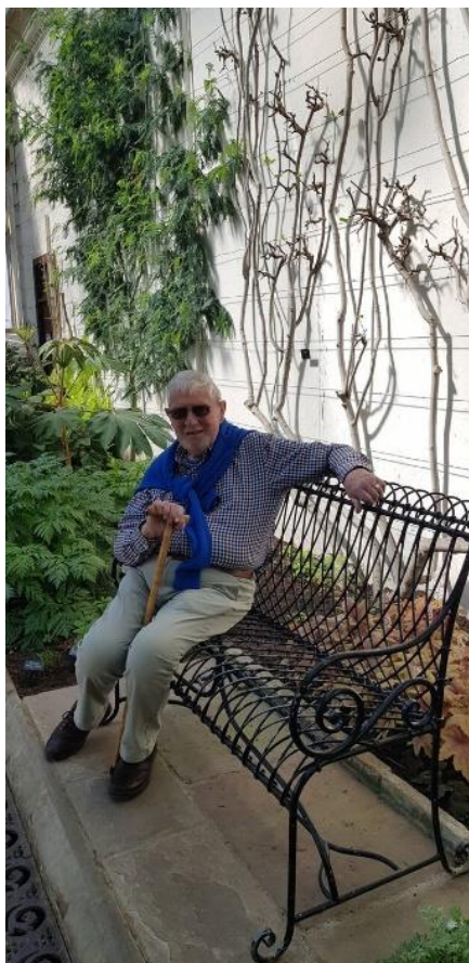
u3a poet seeking inspiration in Lyme Orangery

"Now as I was young...." I would cheerfully Lace up my boots and trample Full of energy on Kinder's slopes, Scrambling on gritstone track Or standing solemn At the crumbled edge of Some deep, peat, grough, To view the incongruous metal litter Of a B24 Liberator, fatally mis-led By altimeter or pilot error to Make moorland graves For its young fliers. Now, at the slightest incline I must stop for breath - Pause - whilst the battery-box, (So neatly implanted Beneath my shoulder), Regulates my ailing heartbeat And restores my willpower.