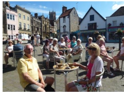
(left) Coffee in the sun at Glastonbury