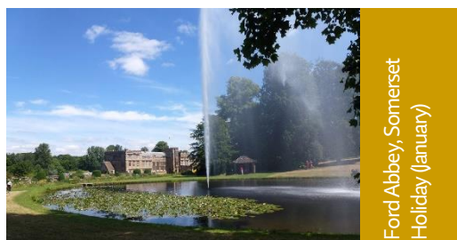
Ford Abbey, Somerset Holiday (January)