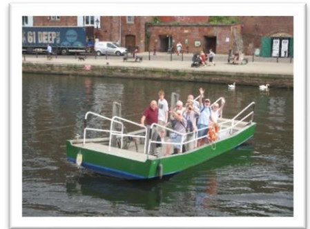
(right) Taking the ferry at Exeter Quays