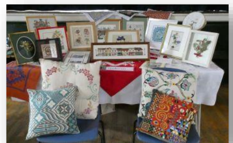
A Wonderful Selection of Finished Pieces by the Needlecraft Group Members