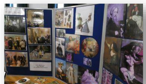
An Example of the Range of Studies from Members of the Art Appreciation Group